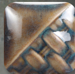
SW-108 Green Tea