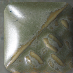
SW-108 Green Tea